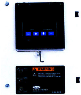
Remote-mount micro controller